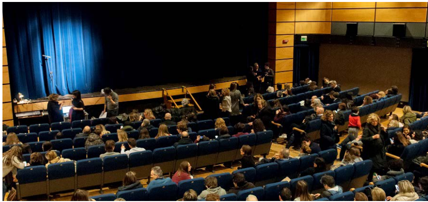
Figure 2. Theatre Teaches, the spectators, University of Brescia (2018).

Referring to the review carried out by Taylor and Ladkin (2009) it is possible to distinguish all four different methods of training using Theatre Teaches. In particular, Transfer of Skill and Manufacturing are the most developed ones.