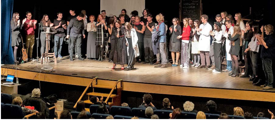
Figure 1. Theatre Teaches, Professor and students, University of Brescia (2018).