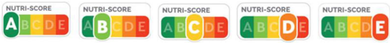
Fig. 1 The Nutri-Score labelling system. This system is a summary, colour-coded, graded FOP label that shows a scale of five colours, from dark green to red. The Nutri-Score system combines positive characteristics (i.e., fruit, vegetables and nuts, fibre, protein and seed, walnut and olive oils content) with negative characteristics

(i.e., energy, total sugar, saturated fatty acids and sodium content) to achieve a score between -15 (most healthy) and +40 (least healthy). As shown, this score is reduced to a combination of a letter (A to E), where A reflects the highest nutritional quality and E the lowest