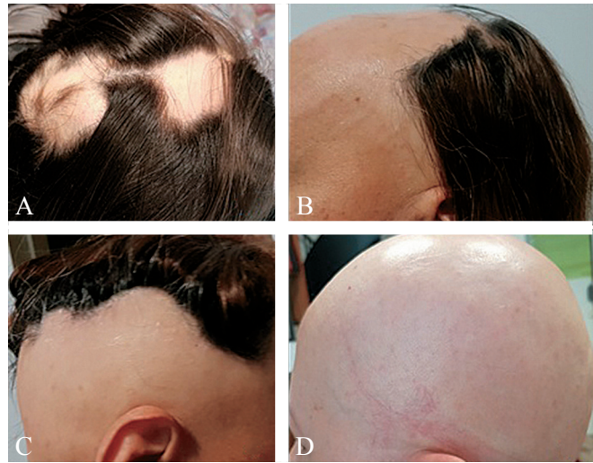
Figure 1.—Clinical types of alopecia areata. A) patchy alopecia; B) si-saïpho pattern; C) ophiasis pattern; D) alopecia totalis.

According to prognosis AA has been historically categorized into four types by Ikeda 14 and after on this basis,