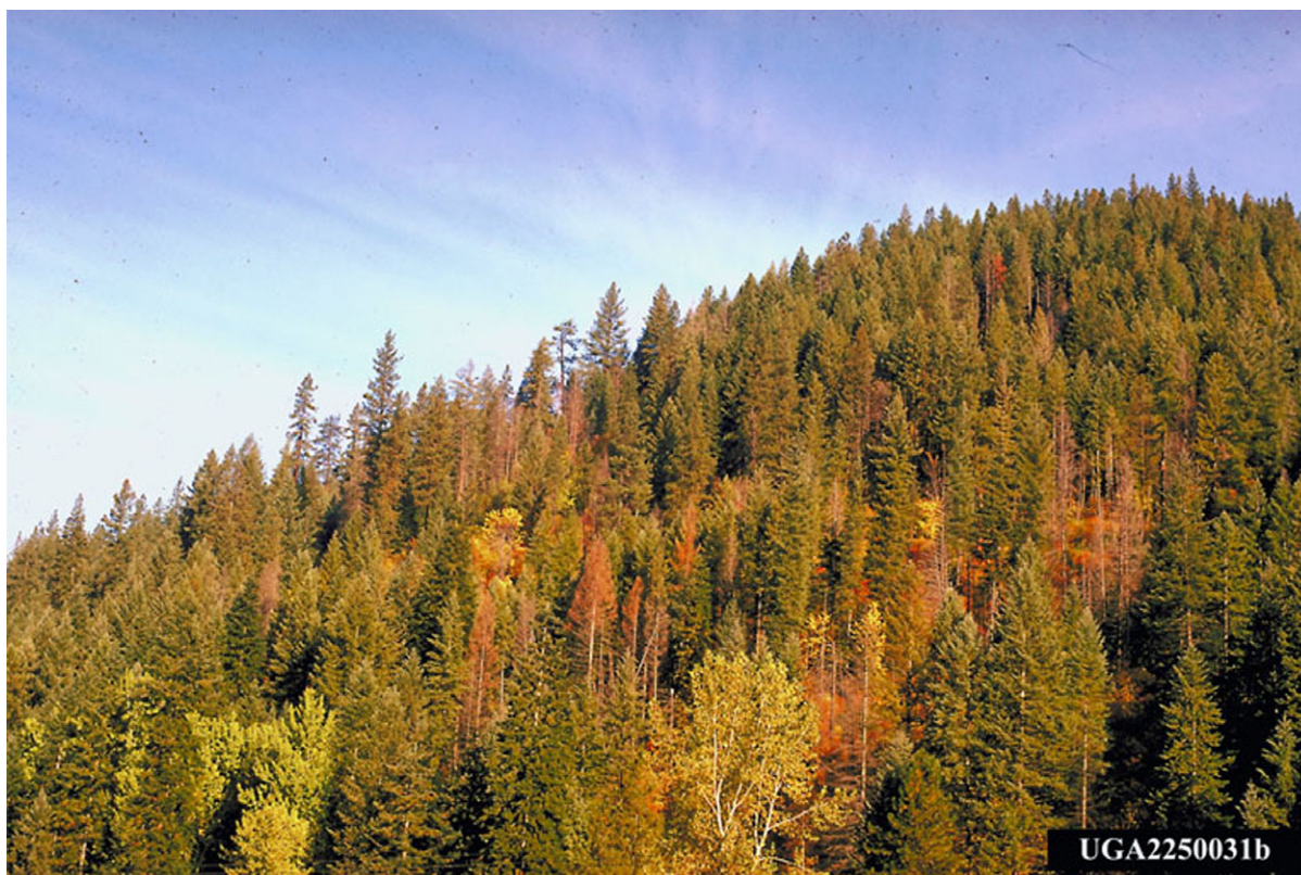
Figure 4: Mortality centre due to Coniferiporia sulphurascens/weirii in the USA

The fungus causes reduction in tree growth due to reduced nutrient and water uptake, and because of the allocation of resources to defence rather than to growth (Lewis, 2013). Thies (1983) estimated growth rates in trees killed by C. sulphurascens as 32% less than those of healthy counterparts in their last 10 years of growth. Goheen and Hansen (1993) estimated a combined growth reduction and mortality loss of 40–70% in infested areas (reviewed by Lewis, 2013).