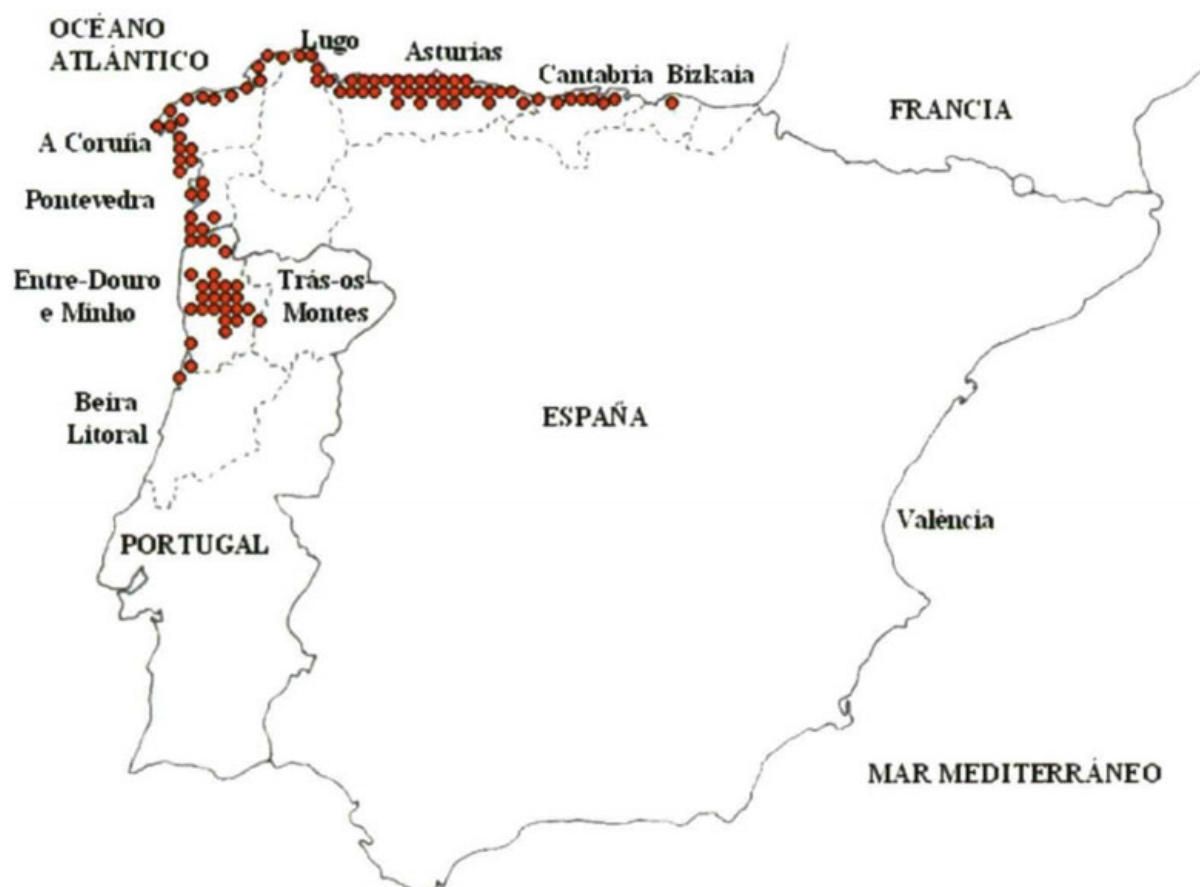
Figure 2: Distribution of T. citricida in the northwest of the Iberian Peninsula in 2007 (source: Hermoso de Mendoza et al., 2008). Red dots represent positive detection points