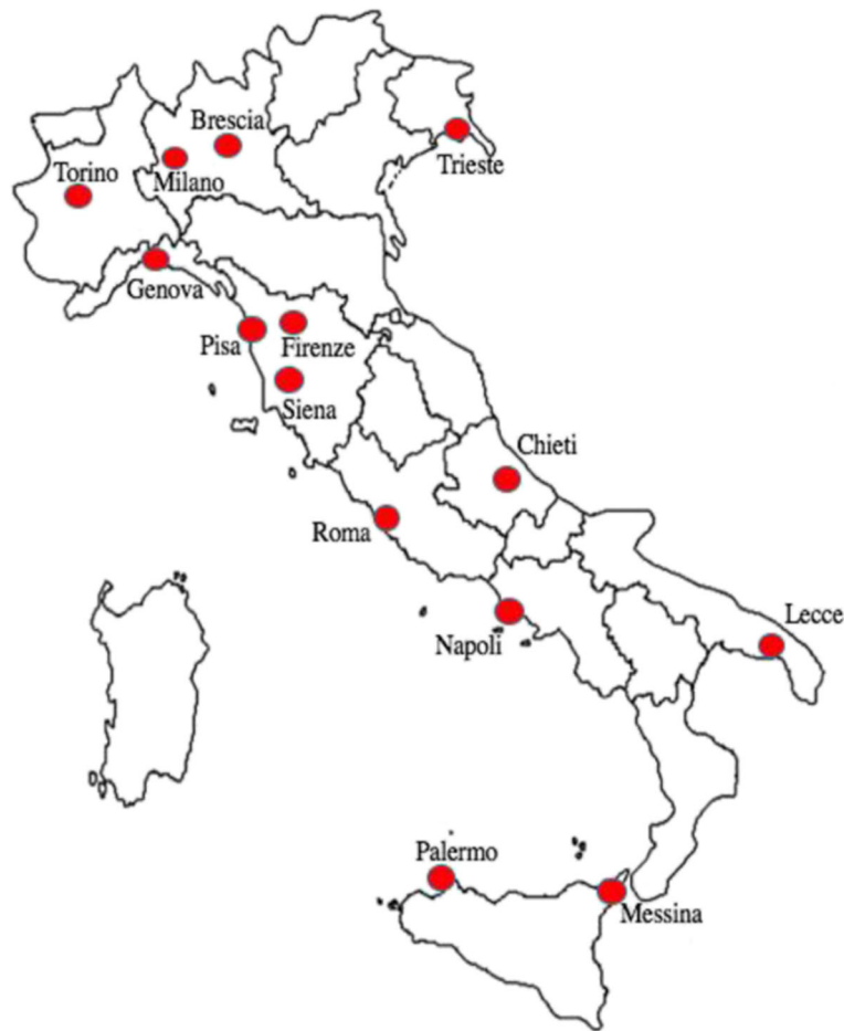
Fig. 1 Italian Pediatric Rheumatologic Centers

familial cases in 12% of our patients. Average age at onset was 8.34 \pm 4.11 years and average age at diagnosis 11.29 \pm 3.95 years. All patients were Caucasians.