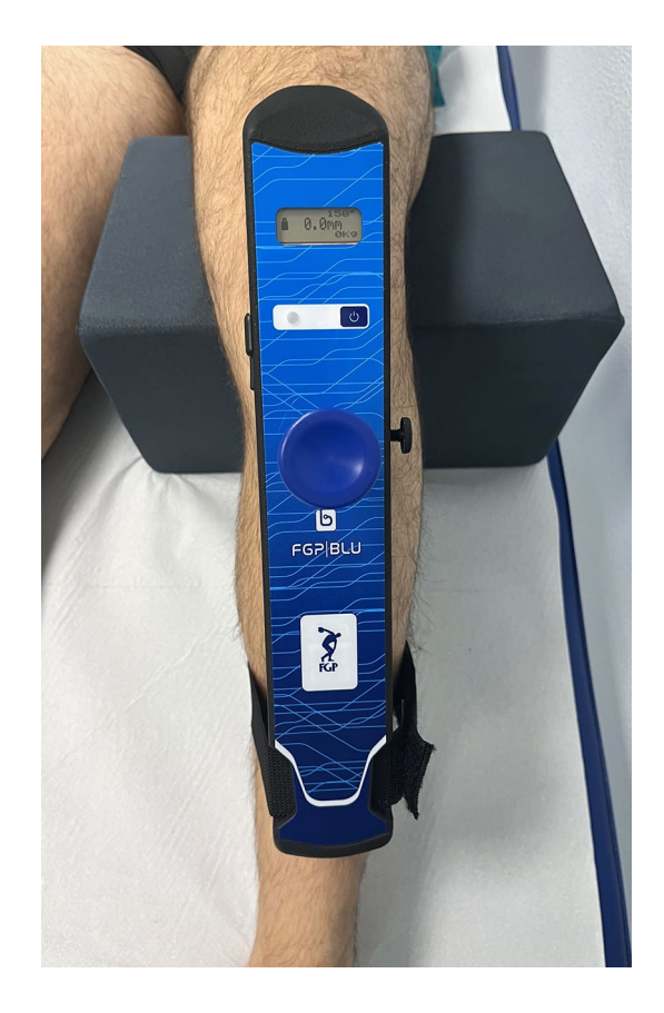
Fig. 2 The examiner can control the variables during the examination on the digital display, where the knee flexion angle, anterior tibial translation expressed in mm and applied force expressed in kilograms can be viewed

All measurements were performed in a standardized setting, with a knee at 30 degrees of flexion in neutral rotation with the aid of a semi-rigid wedge placed at the level of the popliteal fossa. Once the arthrometer had been correctly applied, as previously described, the display was reset