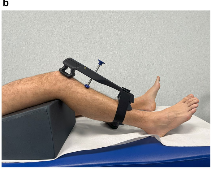
Fig.1 AThe BLU-DAT laxity testing device. Displacement on the sagittal plane is measured by a magnetic linear encoder whose mobile part is applied to a sliding rod enveloped in a guiding probe, which is attached to the body of the arthrometer. B Correct position with the