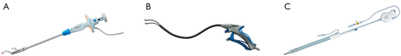
Figure 3 Bipolar radiofrequency technique and convergent technique. (A) Atricure bipolar RF clamp (Synergy System; Atricure, West Chester, OH, USA). (B) Medtronic bipolar RF clamp (Medtronic Cardioblate Gemini, Medtronic, Minneapolis, MN, USA). (C) Convergent hybrid ablation device (Epi-Sense Guided Coagulation System, AtriCure, Inc., Mason, OH, USA). RF, radiofrequency.

To date, there is only one available device specifically designed for minimally invasive epicardial surgical closure (AtriClip PRO2; Atricure).