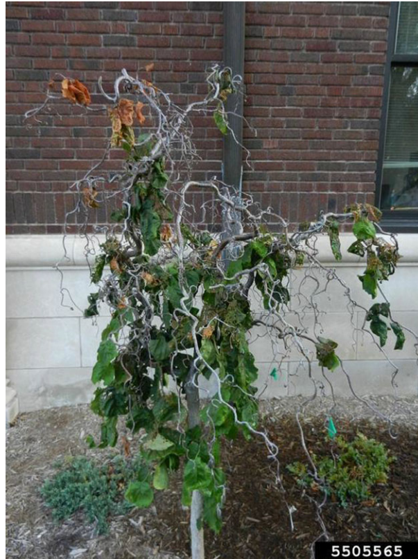
Figure 3: Symptoms of Anisogramma anomala on ornamental Corylus avellana .