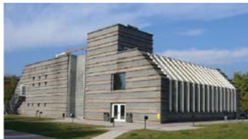
Figure 1: Smart Campus demonstrator

The case study is a two-floor classroom building, characterized by low energy efficiency. Realized in the nineties, it is located in the department of Civil and Architectural Engineering of the University of Brescia (Figure 1). The building has also an underground floor where two computer laboratories are located. A two-level glazed atrium closes the south-east side and it is used as a free study room during the day.