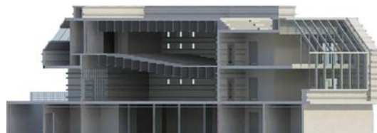
Figure 2: Architectural Building Information Model

An Asset Information Model of the building has been created - including architectural (Figure 2), structural and MEP elements - in order to digitalize the original documentation, to update it to the as-built condition and to support an energy analysis by means of a BIM-to-BEM (Building Energy Modelling) workflow (Ciribini et al, 2015). Moreover, other BIM uses have been implemented related to the operation and maintenance phases and the creation of an information base in order to support the decision-making process in case of any possible future intervention on the building.